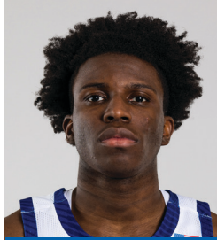
#1 - RICHMOND

Season --> -- Career --> 23 Streak --> --