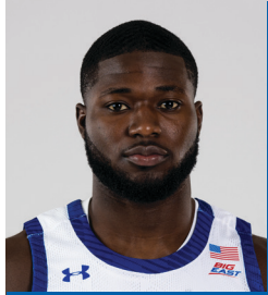
#0 - WUSU