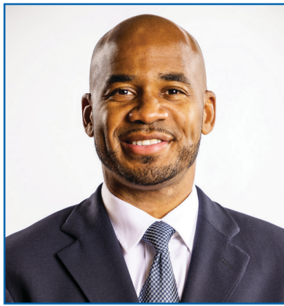
Desire. Dedication. Discipline.