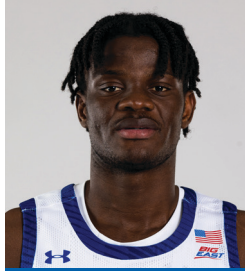
#7 - NGANGA

Season --> -- Career --> 9 Streak --> --