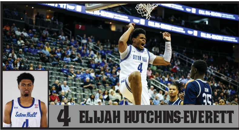
Junior • Center • 6-11 • 255 • Orange, N.J. / Austin Peay

>> Transferred to Seton Hall after spending two seasons at Austin Peay >> Named 2022 OVC Freshman of the Year; was first freshman in Austin Peay history to lead team in scoring (12.3), rebounding (6.8), and FG% (51%) >> Last season, led Austin Peay in points, rebounds, field goals, defensive rebounds, free throws and blocks