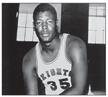
The top three rebound totals in Creighton single-season history belong to Paul Silas.