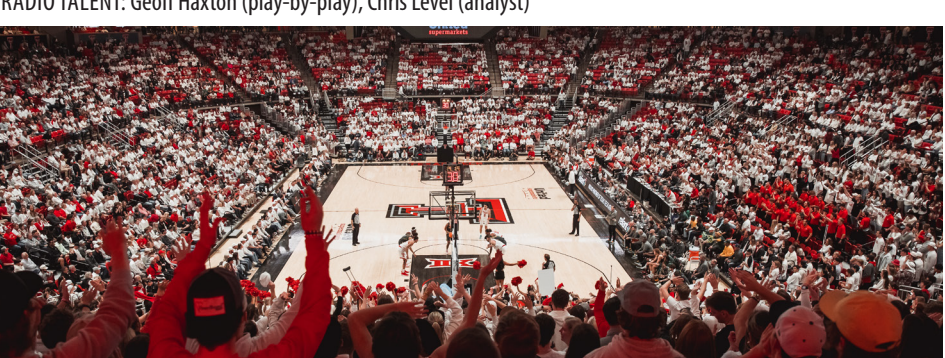
LUBBOCK, Texas — The restoration project of its season continues this weekend for Texas Tech which travels to Waco for a matchup against No. 11 Baylor at noon on Saturday inside the Ferrell Center.