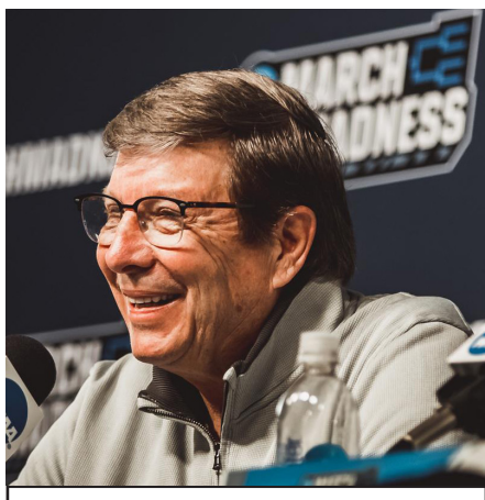
TEXAS TECH COACHING STAFF (Full staff/bios at TexasTech.com)