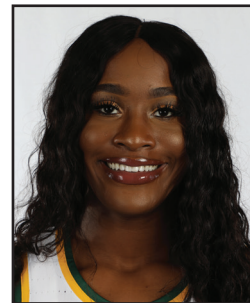
25 - QUEEN EGBO