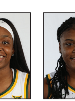
12 · MOON URSIN G · 5·6 · Sr. Destrehan, La.