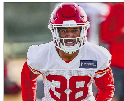
L'Jarius Sneed was drafted in the fourth round of 2020 NFL draft by the Kansas City