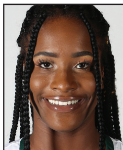
25 · QUEEN EGBO