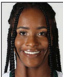
25 · QUEEN EGBO