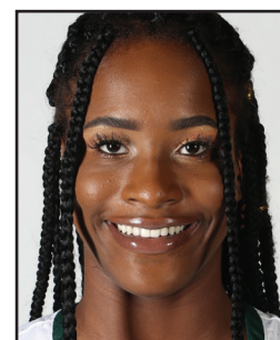
25 · QUEEN EGBO