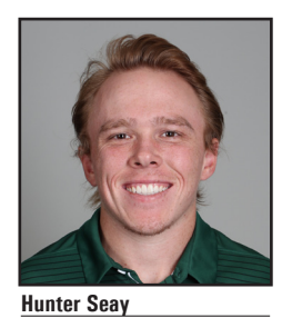
OF/LHP • Jr. (2L) L/L • 6-0 • 180 Keller, Texas (Keller HS)