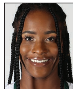
25 · QUEEN EGBO