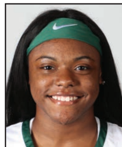
12 · MOON UR SIN