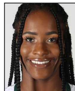
25 · QUEEN EGBO