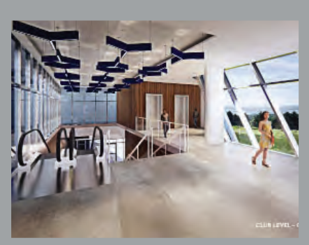
Club Level Entry