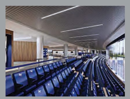
Club Level Seating