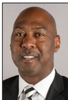
Danny Manning Assistant Coach First Season