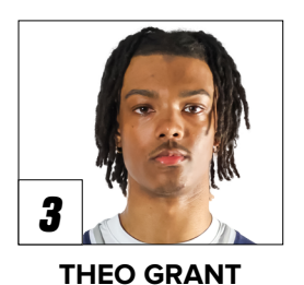
JUNIOR GUARD 6-3 | 170 | Schertz, Texas