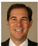
Scott Drew Head Coach 21st season at BU