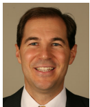
Scott Drew Head Coach 21st season at BU