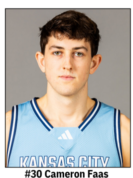
Jr. | F | 6'6 7.5 ppg | 1.5 apg | 1.0 spg