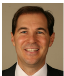
Scott Drew Head Coach 20th season at BU