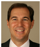
Scott Drew Head Coach 20th season at BU