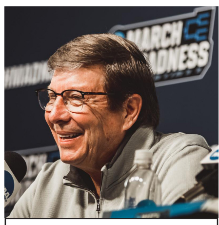
TEXAS TECH COACHING STAFF (Full staff/bios at TexasTech.com)