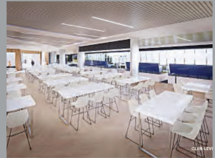
Club Level Banquet