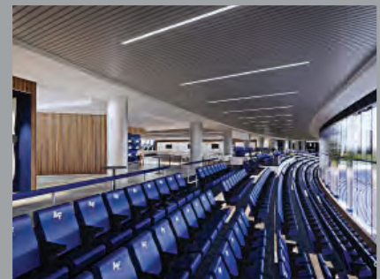
Club Level Seating