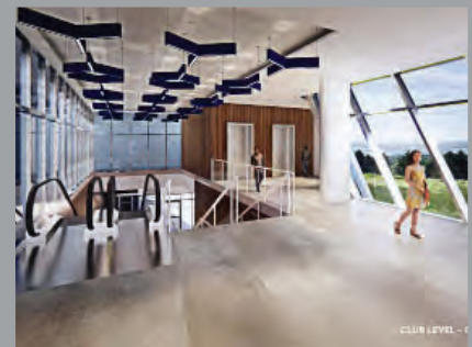
Club Level Entry