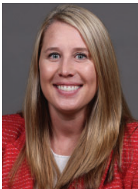
Head Coach Dani Busboom Kelly Nebraska 2007

31 NCAA Appearances | 30 Conference Championships | 8 Sweet Sixteens | 2 Elite Eights | 1 Final Four