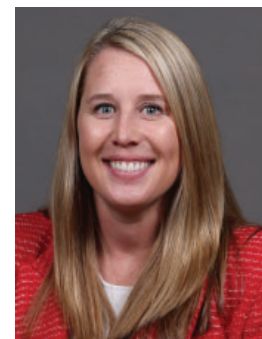
Dani Busboom Kelly