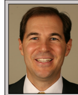
SCOTT DREW HEAD COACH 20TH SEASON AT BAYLOR