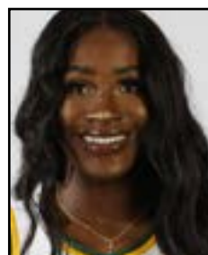
4 · QUEEN EGBO