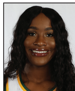
25 - QUEEN EGBO