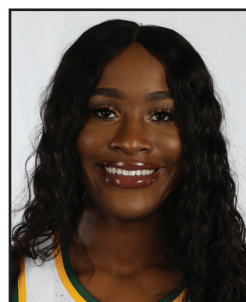
25 - QUEEN EGBO