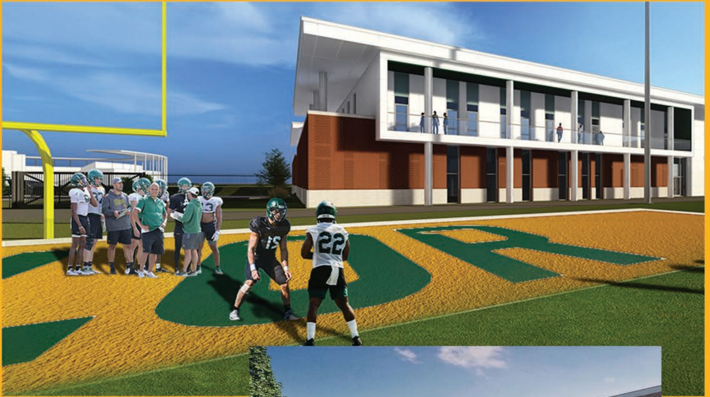
FUDGE FOOTBALL DEVELOPMENT CENTER